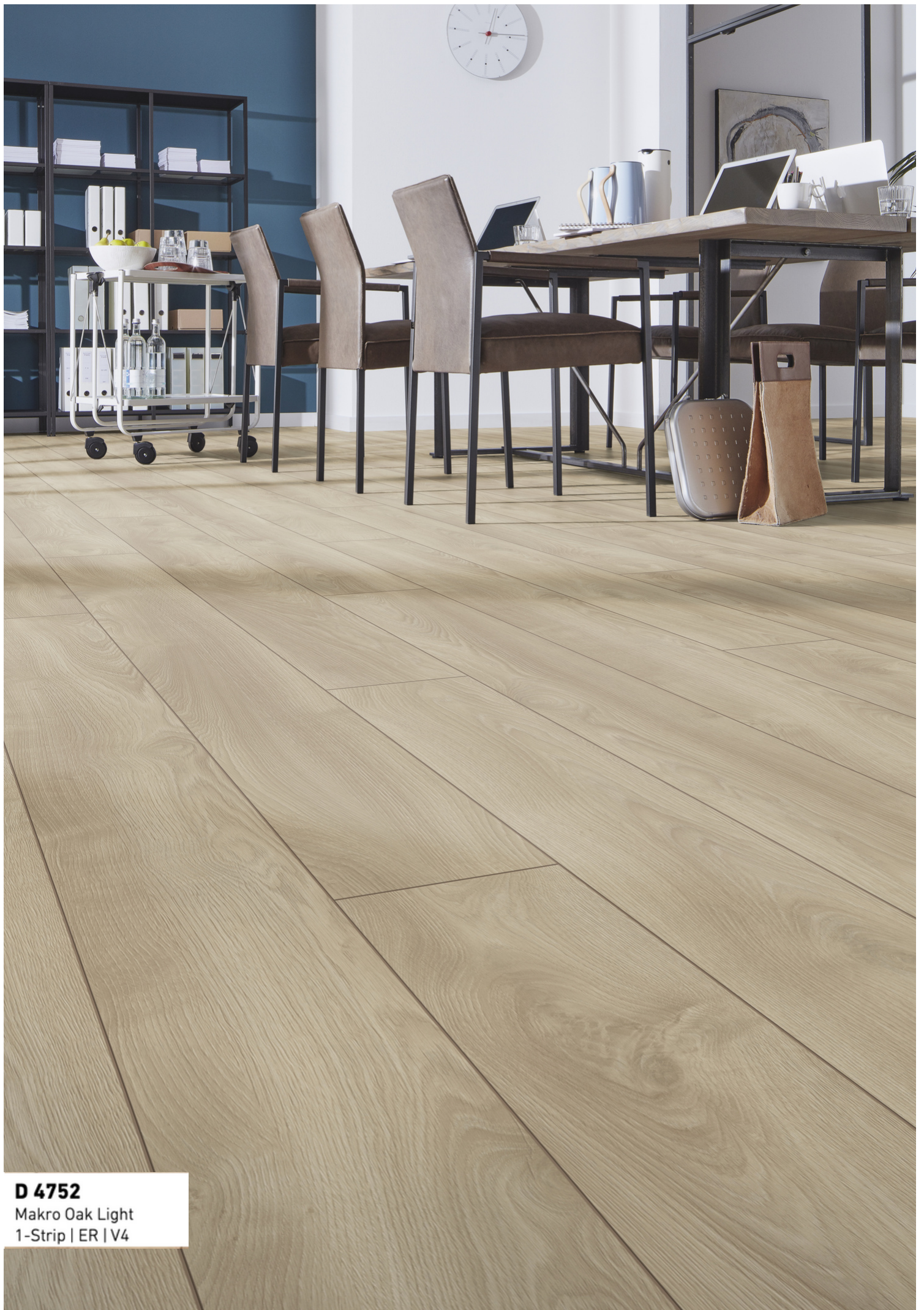
D 4752 Makro Oak Light 1-Strip | ER | V4