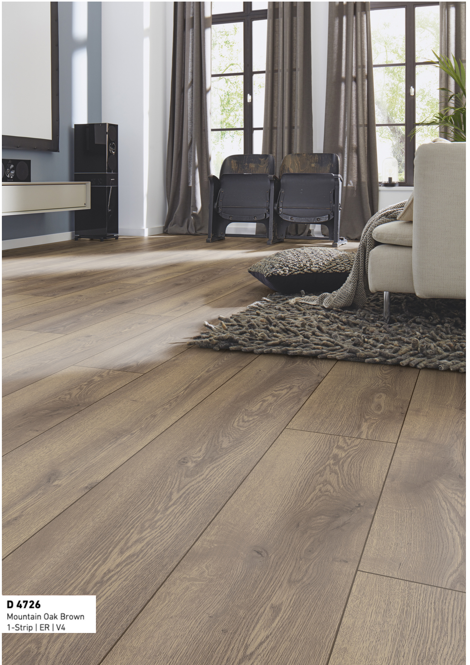
D 4726 Mountain Oak Brown 1-Strip | ER | V4